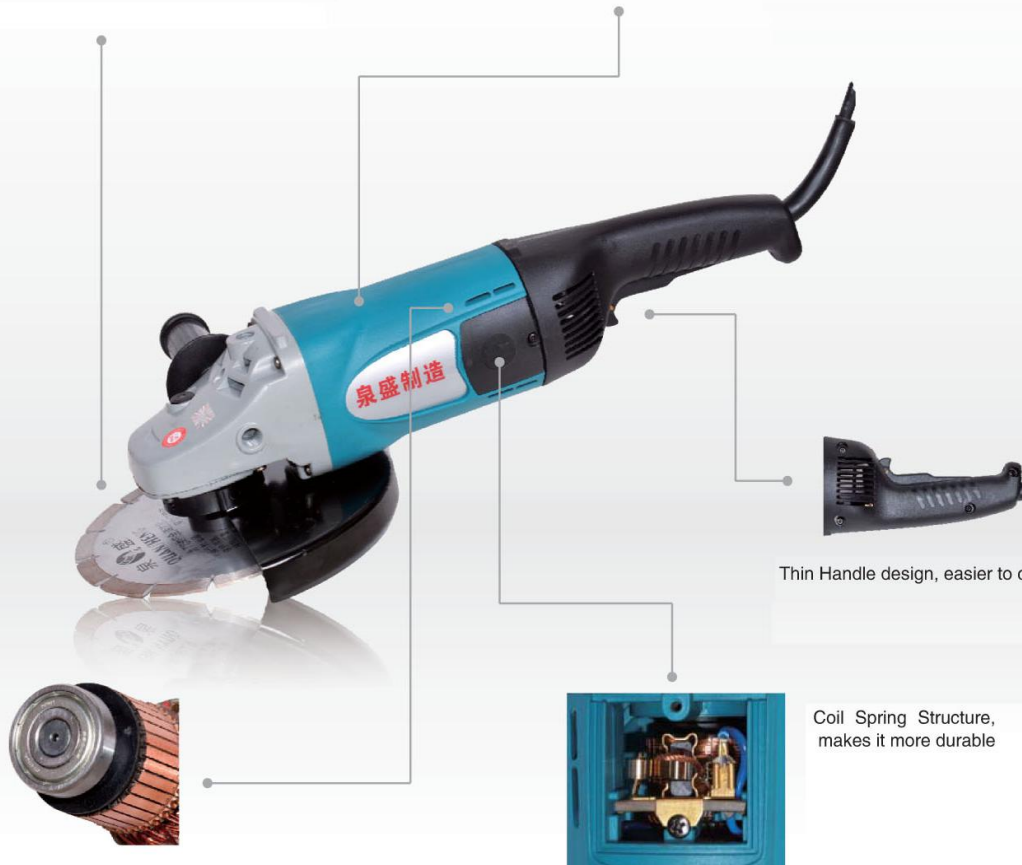
Thin Handle design, easier to control.