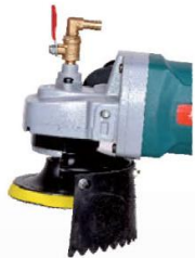
Top Quality Faucet, Better Waterproof.