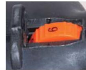
Constant Soft Start-up, 6-Level Switches give you more choices.