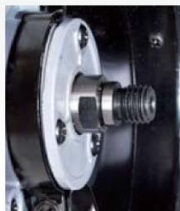
Various sizes Armatures ( M14 & M16 & 5/8-11 )