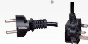
Various Plugs for different countries.